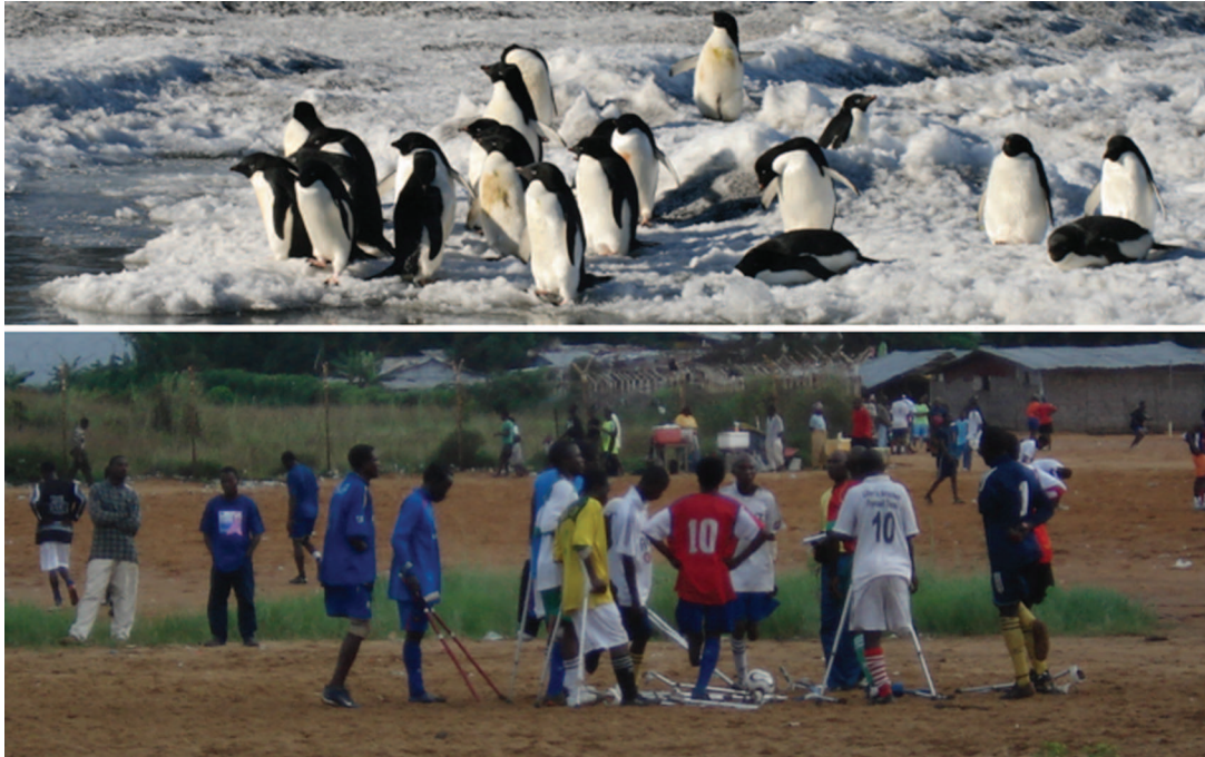
Figure 2. Above: Spheniscus demersus or blackfooted penguin in Antarctica. Below: Homo sapiens , or humans in Africa. Both groups have a statistically similar chance of interacting with a Psychiatrist. Note that the penguins all have legs.

physical therapy—reach only 1–2% of persons with disability [16]. It is fruitful to explore potential reasons for this mismatch in Africa.